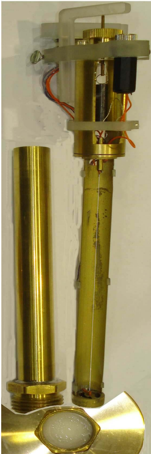
Fig. 5: Improved, Teflon-coated Platinum Hot-Wire Thermal Conductivity (HWTC) cell for nanofluid TC measurements [15].

interactions (collaboration with NIU Chemistry) will be very useful for understanding of underlying